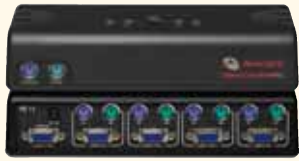
SwitchView PC switch

The Avocent SwitchView PC KVM desktop switches let you control up to four PS/2 computers from one keyboard, monitor and mouse. Lighted LED indicates which computer you are accessing and audible indicators confirm channel switching. With color-coded cables for easy installation, customizable channel selections and error-free boot-up, the SwitchView PC switch offers you a complete desktop KVM solution.