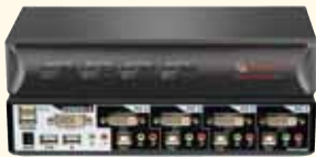
SwitchView DVI switch

The SwitchView DVI (Digital Visual Interface) KVM switches feature 1920 x 1200 video resolution and deliver crisp images for your high-end displays and flat panel monitors. The versatile SwitchView DVI KVM switch is available in 2 and 4-port models. It easily manages up to four USB DVI computers from a single USB keyboard, mouse and DVI monitor.