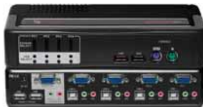
SwitchView Multimedia switch