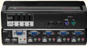
SwitchView Multimedia switch

The all-in-one SwitchView MM (Multimedia) desktop KVM switches let you switch between USB or PS/2 systems, share your USB devices and control multimedia applications. With one SwitchView Multimedia switch, you can control multiple PCs and share access to your USB devices: digital camera, CD-ROM, PDA, scanner or printer. The SwitchView Multimedia KVM switches are available in 2 and 4 port models, with USB 1.1 and USB 2.0 support.